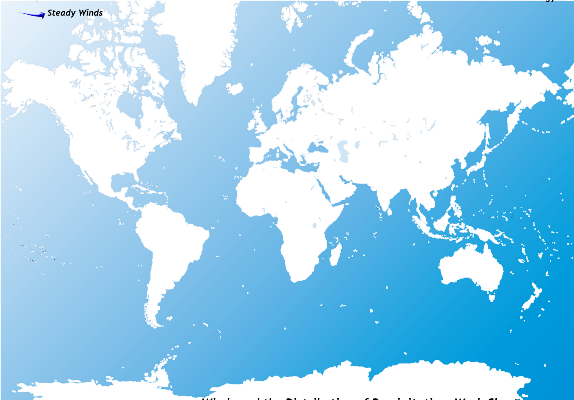
Winds and the Distribution of Precipitation: Work Chart